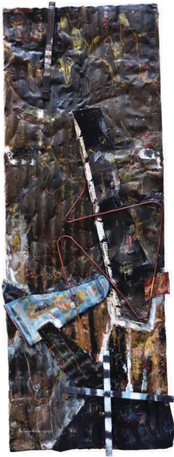
Reconstructing a Site - 3 Size: 213 cm X 86 cm, Media: Media: enamel, pastel and bitumen on metal sheet