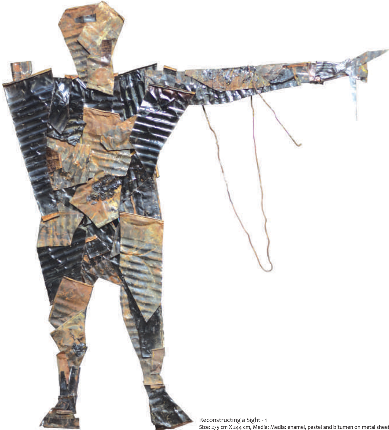
Reconstructing a Sight - 1 Size: 275 cm X 244 cm, Media: Media: enamel, pastel and bitumen on metal sheet