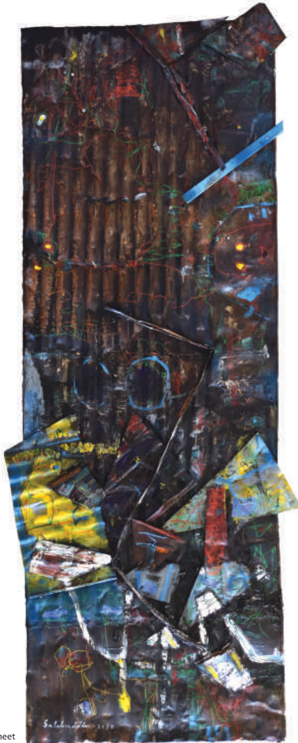
Reconstructing a Site - 4 Size: 213 cm X 86 cm, Media: enamel, pastel and bitumen on metal sheet