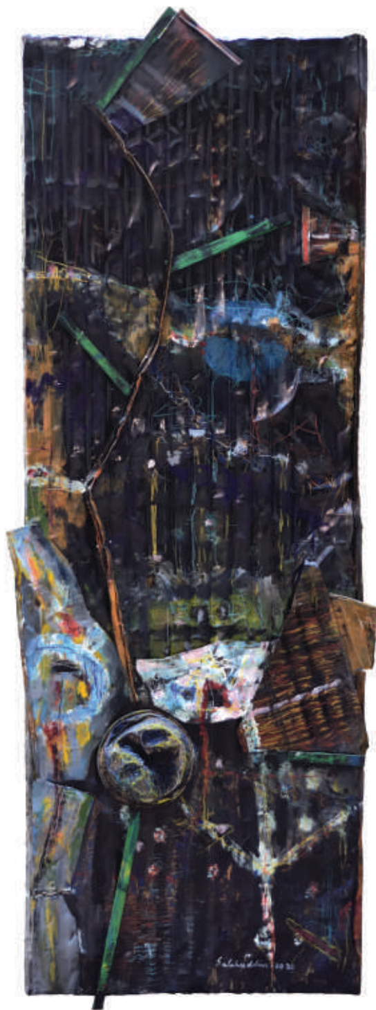
Reconstructing a Site - 2

Size: 213 cm X 86 cm, Media: Media: enamel, pastel and bitumen on metal sheet