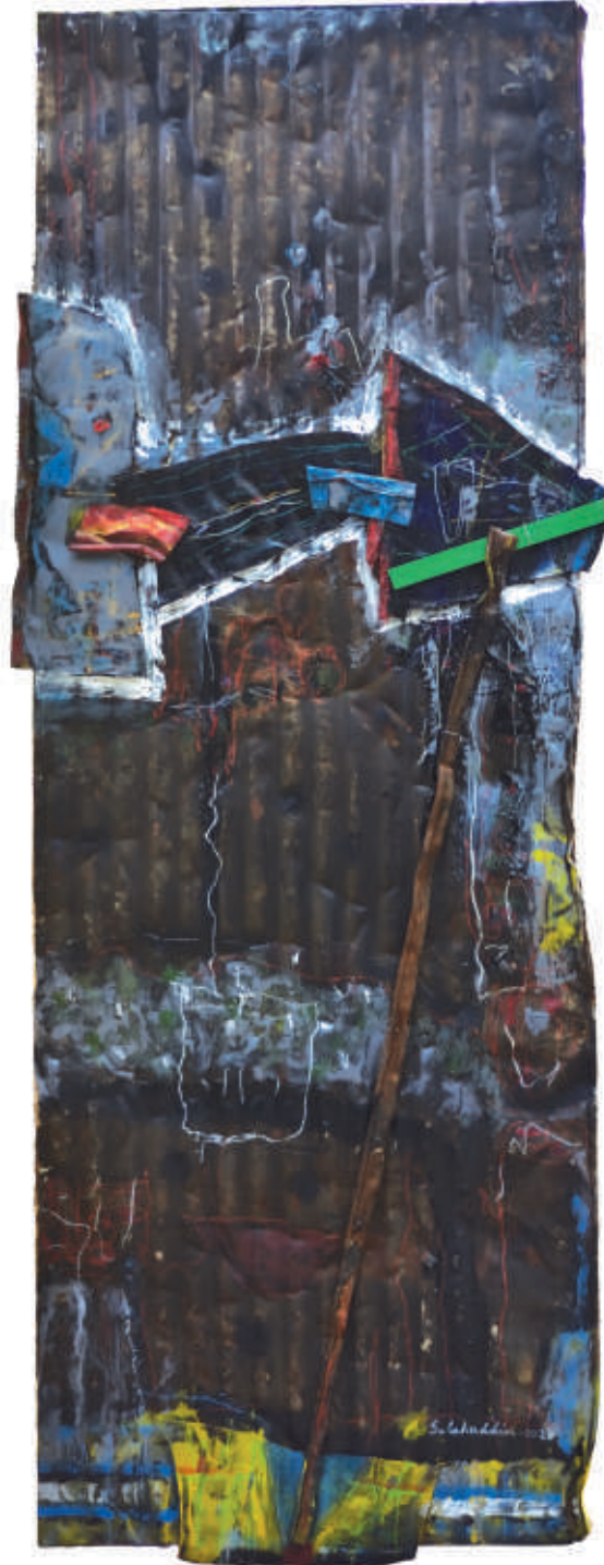
Reconstructing a Site - 1 Size: 213 cm X 86 cm, Media: Media: enamel, pastel and bitumen on metal sheet