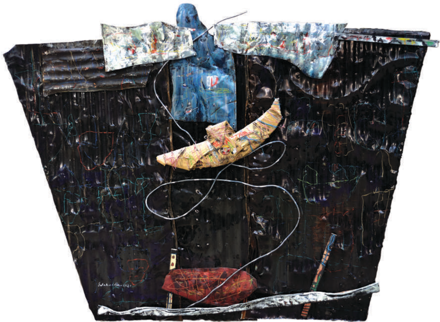
Reconstructing a Site - 6 Size: 165 cm X 213 cm Media: Media: enamel, pastel and bitumen on metal sheet