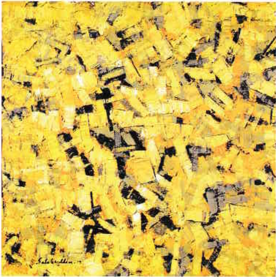
Organic City-2, Media Oil and Wood dust on Paper, Size 80 X 80 cm, 2015