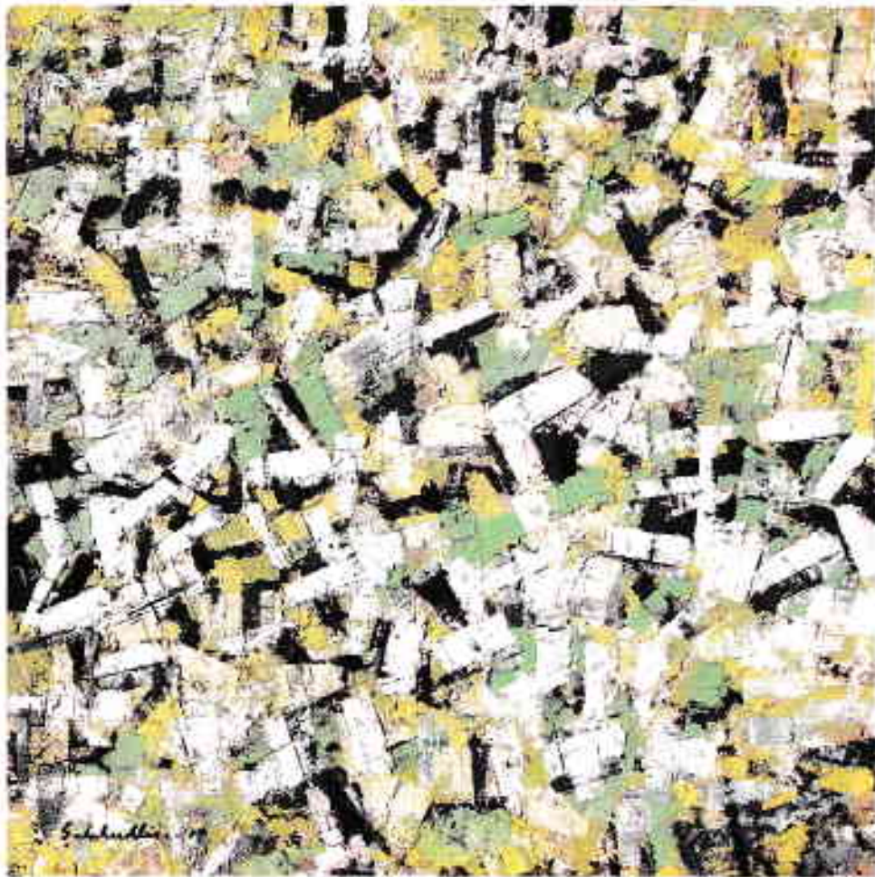
Organic City-5, Media: Oil and Wood dust on Paper, Size: 80 X 80 cm, 2015