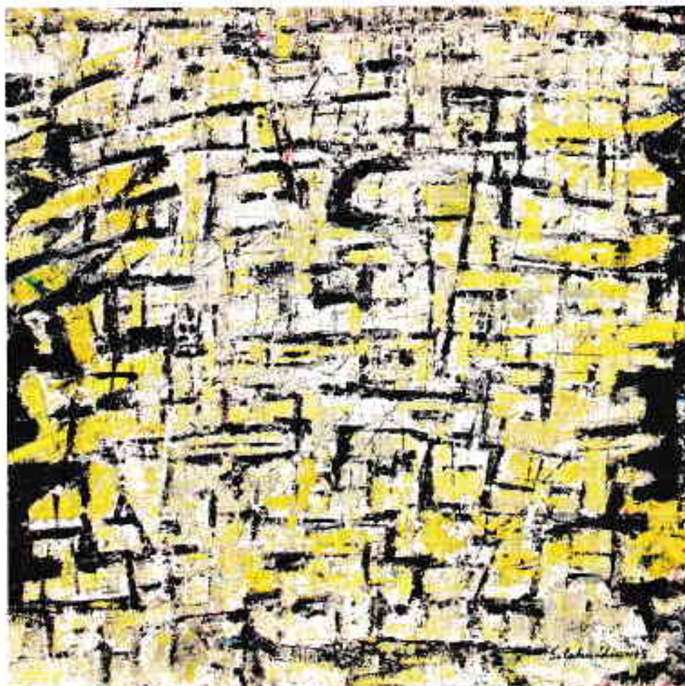
Organic City-3, Media: Oil and Wood dust on Paper, Size: 60 X 80 cm, 2015