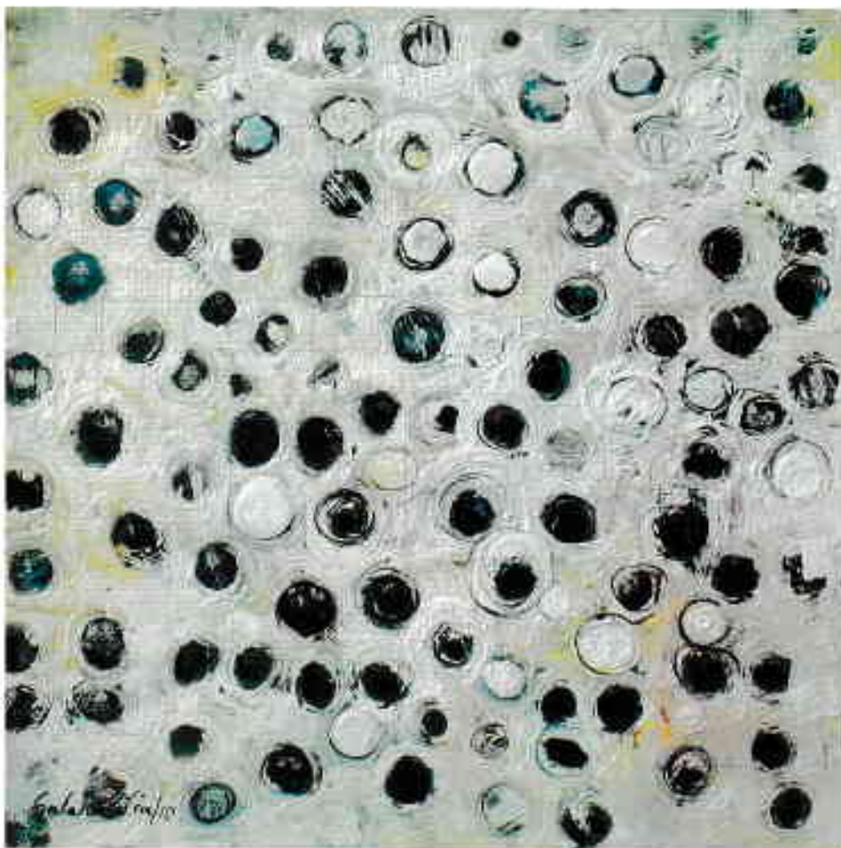
image 61 x 61 cm mixed media 2010