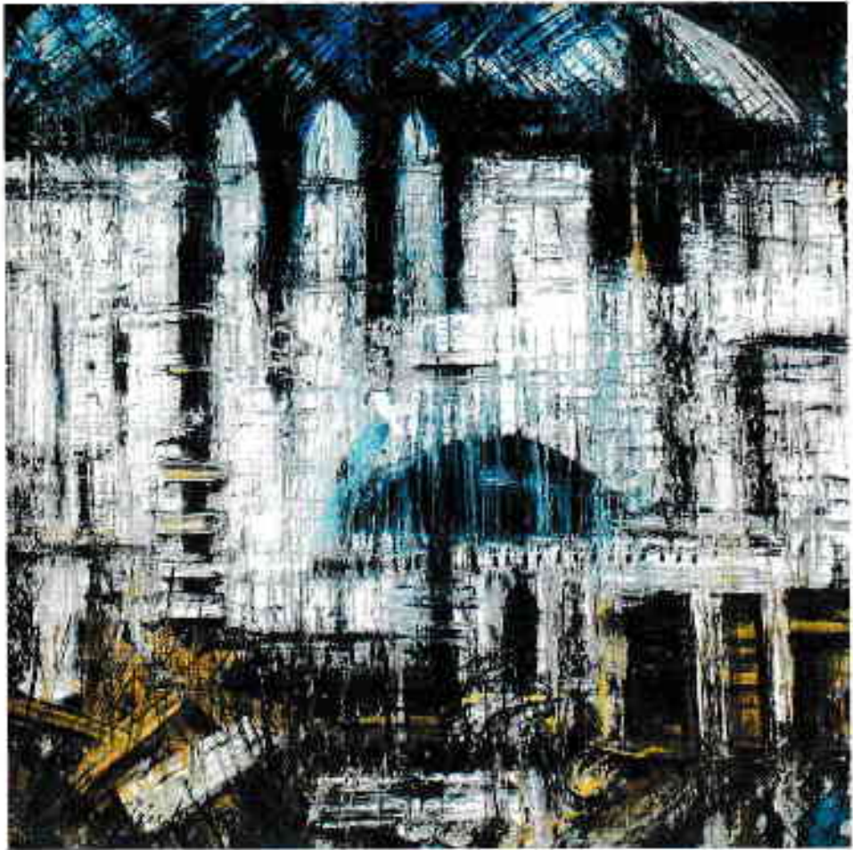
image of the city 61 x 61 cm mixed media 2010