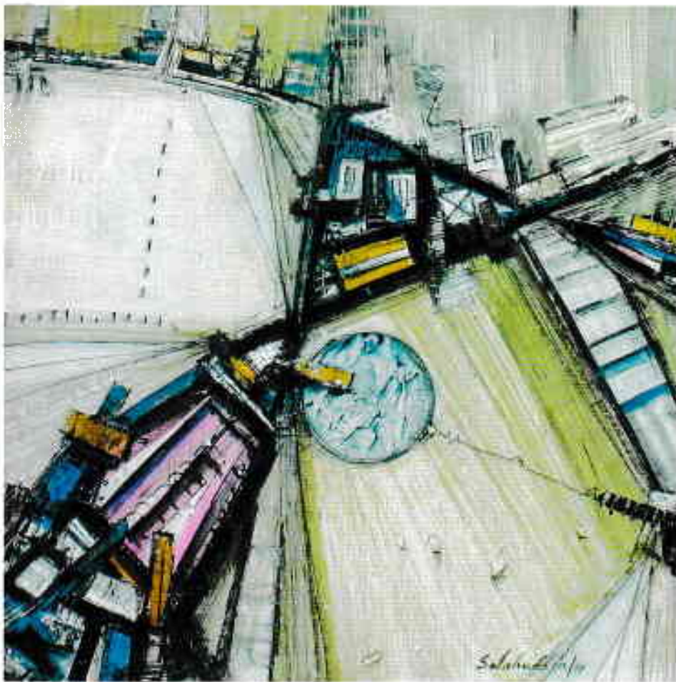
image of the city 61 x 61 cm mixed media 2010