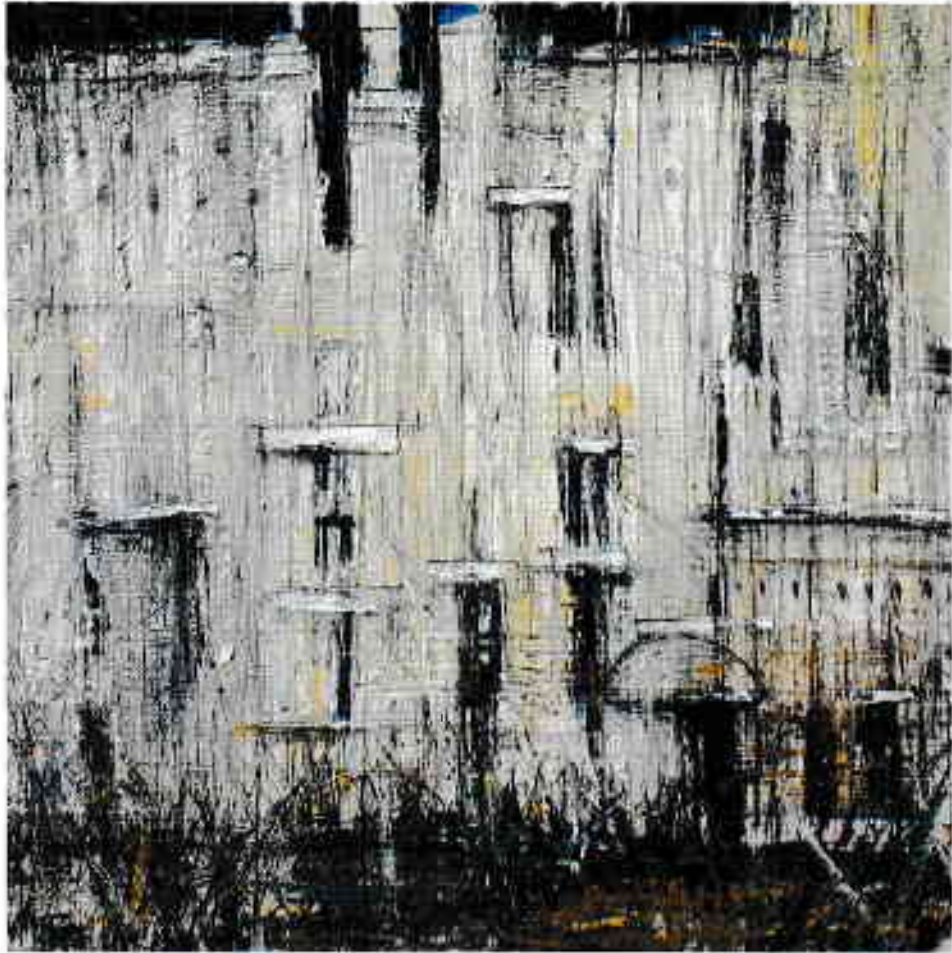
image of the city 61 x 61 cm mixed media 2010