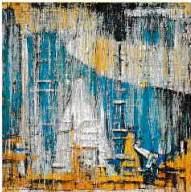
image of the city 61 x 61 cm mixed media 2010